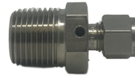
OPTIONAL FITTING WITH 1/8" WEEP HOLE